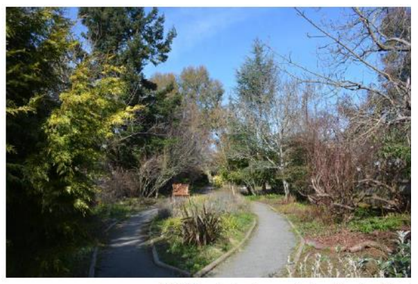
Spirit Garden looking south from Newton Street along existing Bowker Creek pipe alignment

The existing storm main is within Spirit Garden, a narrow section of City parkland that has granular pathways and benches. Based on the depth of the storm main and the available width of the park, it is possible to daylight with some retained sides. This would leave enough room for a path on the east side but little room for gardens.