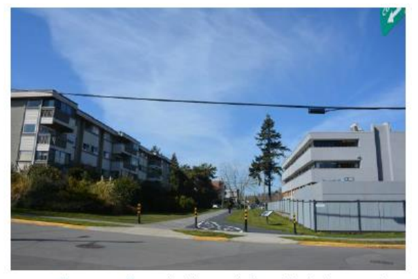
Doncaster Green looking north from Myrtle Avenue along existing Bowker Creek pipe section

Doncaster Green has a narrow 20m wide ROW between multi-storey commercial and residential buildings. The existing storm main is about 5m deep and is adjacent to a 7m deep sanitary sewer. As a result of the limited available width and the depth of the trunk, retaining walls are required to retain side slopes.