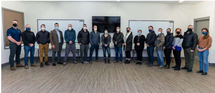
Wounded Warriors Canada conducts trauma resiliency training workshop with VicPD officers and staff