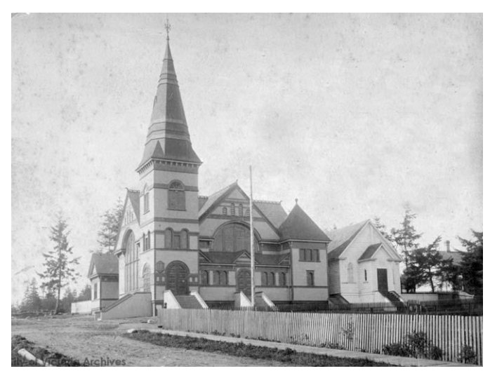
Emmanuel Baptist Church, ca. 1890.

As the Village and the surrounding neighbourhood grow and develop, it is important to retain the character that led to the Village's designation in the first place. Well designed new construction that is sensitive to the historic character, form and scale of the Village and its surroundings has the potential to enhance what makes this place special.