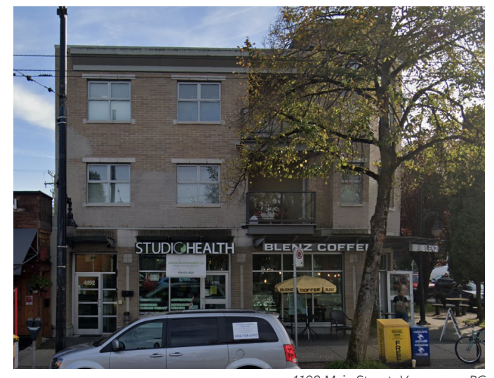
4198 Main Street, Vancouver, BC

This new building has a defined base, middle and top, and verticallyproportioned window opening that fit a historic context.