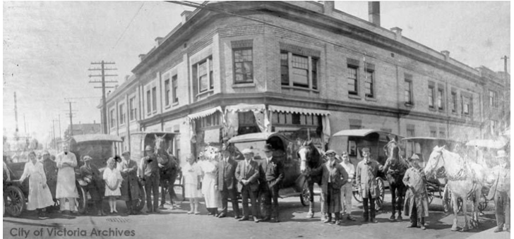
Two-part panorama of the staff at the Rennie and Taylor Bakery, ca. 1920