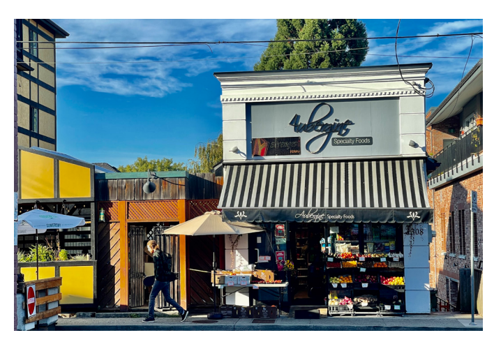
1308 Gladstone Ave., Victoria, BC.

The awning, signage and lighting on this historic building are complimentary to the overall building design and pedestrian scaled.