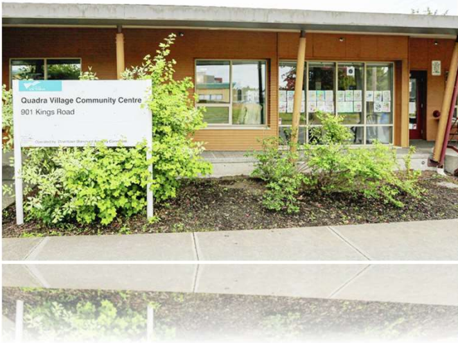
Quadra Village Community Centre