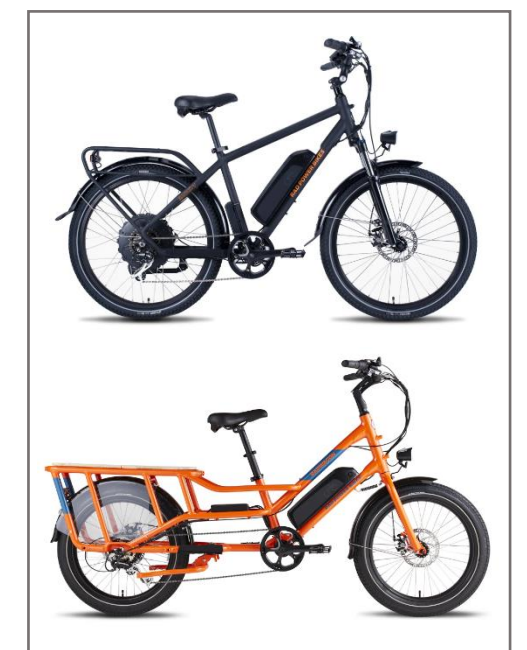
Example of an urban e-bike (top) and cargo e-bike (bottom). In Greater Victoria, the price range of an electric bike is $2,500-$10,000. Providing a mix of e-bikes in the shared e-bike program can help meet the various travel needs of future residents (e.g., shopping, appointments, recreational, etc.)

E-bikes are electric bicycles with an electric motor of 500 watts or less and functioning pedals that are limited to a top speed of 32 km/h without pedalling. They are an emerging transportation phenomenon that are gaining popularity worldwide. With supportive cycling infrastructure in place, E-bikes have the potential to substitute for, or completely replace, almost all trips taken by a gasoline powered car, which could address congestion issues and mitigate parking challenges within urban areas.