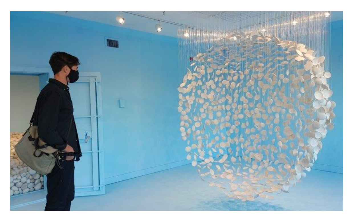
Victoria Arts Council: New Gallery Lighting