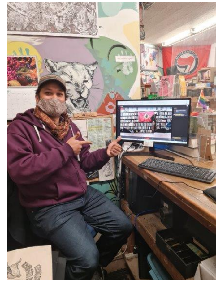
Camas Books: new a/v and sound equipment