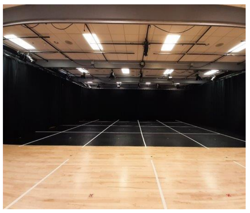
Dance Victoria: Black box theatre space - New Track Lighting & Curtains