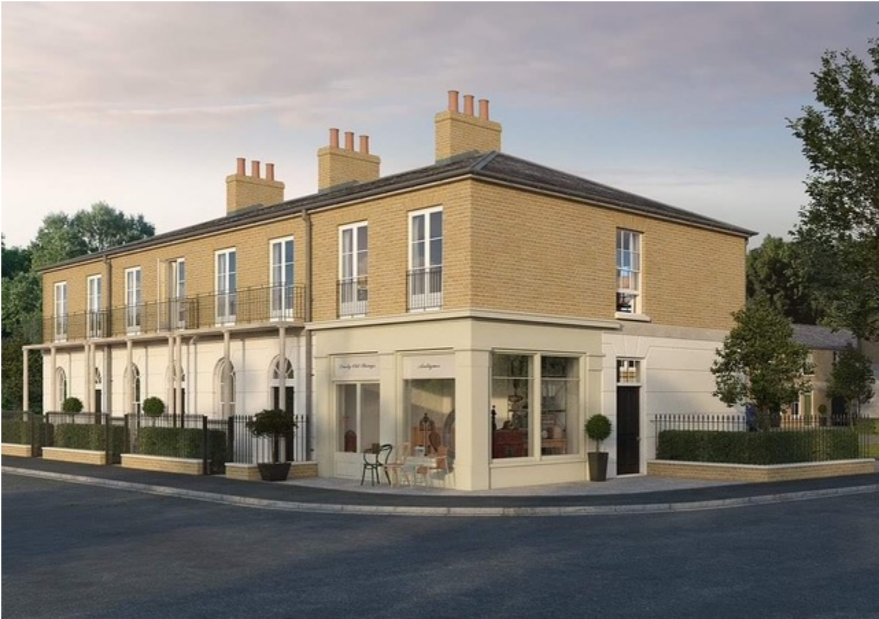
Brooklyn, NY, USA