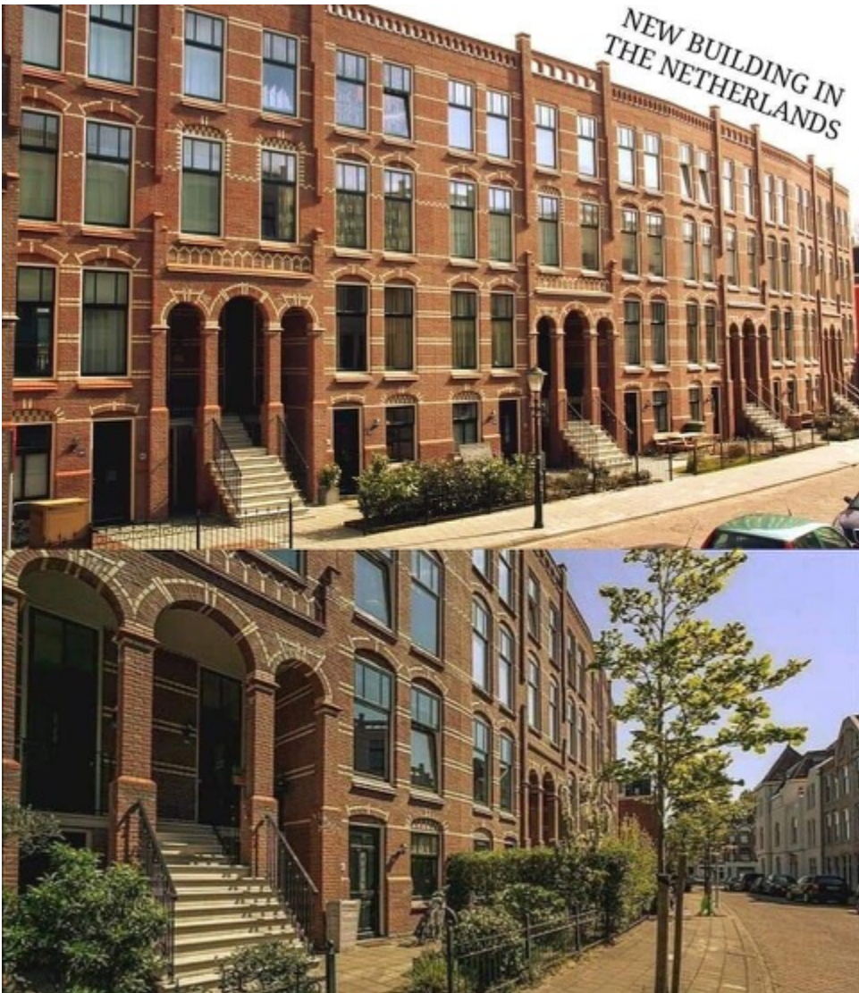
Washington, DC, USA