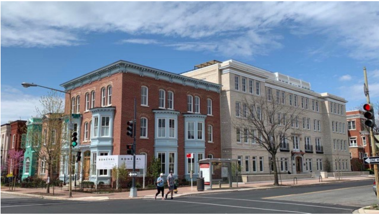
Providence, RI, USA