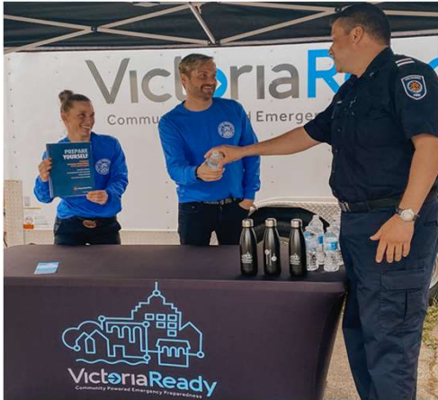
5 Extreme Weather Response Plan | November 10, 2022