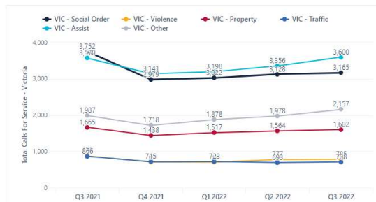
Victoria Total Calls for Service – By Category, Quarterly

Annual trends show a decrease in total CFS in 2019 and 2020. Since January 2019, abandoned calls, which are included in the total number of calls and ran often