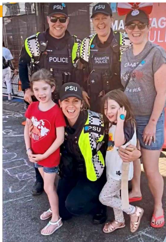
Officers sharing “blue heart” stickers on Canada Day