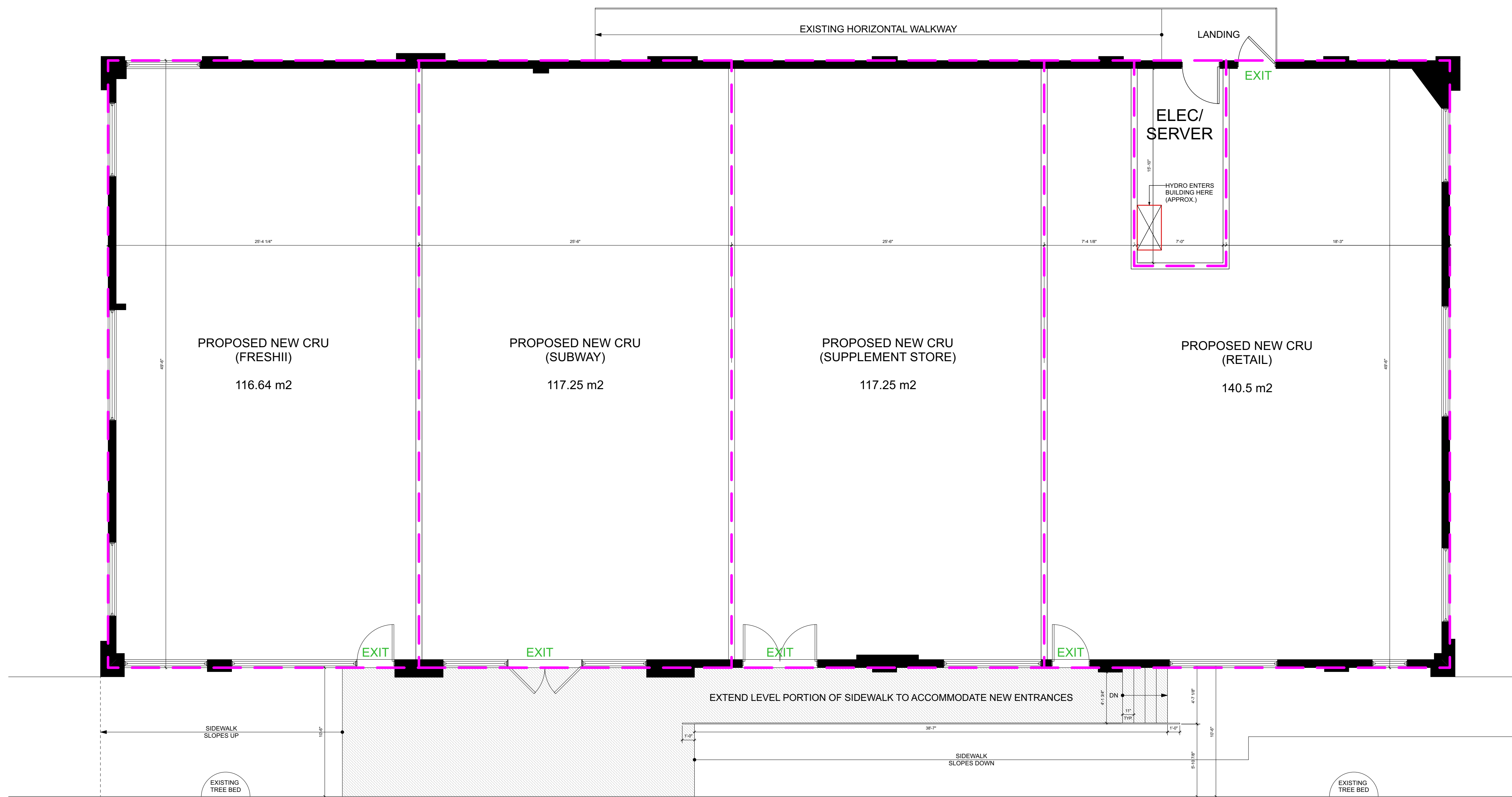
1 A3 PROPOSED DEMISING PLAN 3/16" = 1'-0"