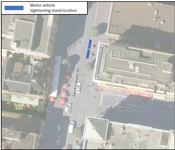
Figure 2 – Proposed New Parking Stand Locations

In 2023, the City worked with Pacific Northwest Transportation Services and Wilsons Transportation Ltd. to relocate the cruise shuttle stop from the 1200 block of Government Street to in front of the Empress following stakeholder feedback, to improve visitor experience and reduce the number of buses driving through downtown. As a result, two new Parking Stands are also recommended to be added to Schedule D through a future Bylaw amendment. These stands are shown in Figure 2, on the east side of Government Street between View Street and Trounce Alley.