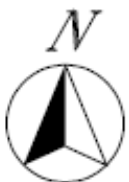
Appendix 1 Development Areas Roundhouse District