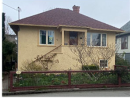
43 Lewis Street, 1928. Designated