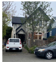
20 Lewis St, 1904