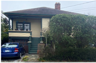
53 Lewis Street, 1929. Designated