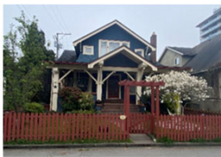
19 Lewis Street, 1913