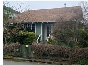
67 Lewis Street, 1924

7 Proposed Lewis Street HCA | November 9, 2023