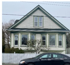
38 Lewis Street, 1911