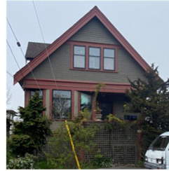
50 Lewis Street, 1912. Designated