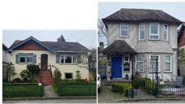
25/27 Lewis Street, 1936 and 1994