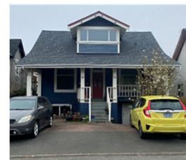
24/26 Lewis St, 1906