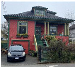
35 Lewis Street, 1908