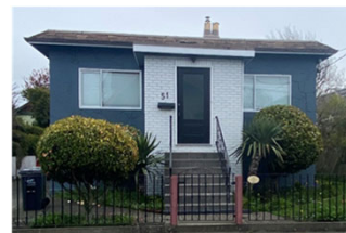
51 Lewis Street, 1925

8 Proposed Lewis Street HCA | November 9, 2023