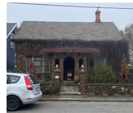
28 Lewis Street, 1907