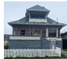
39 Lewis Street, 1908. Designated