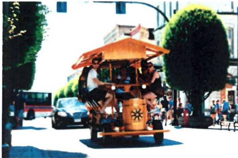
Figure 2 - Rolling Barrel Tour – Government Street

Motion 1 and 2 were completed in the spring of 2017. Following the competitive process for allocation of Stand #3, the Rolling Barrel offered pedal-bike tours from that location.