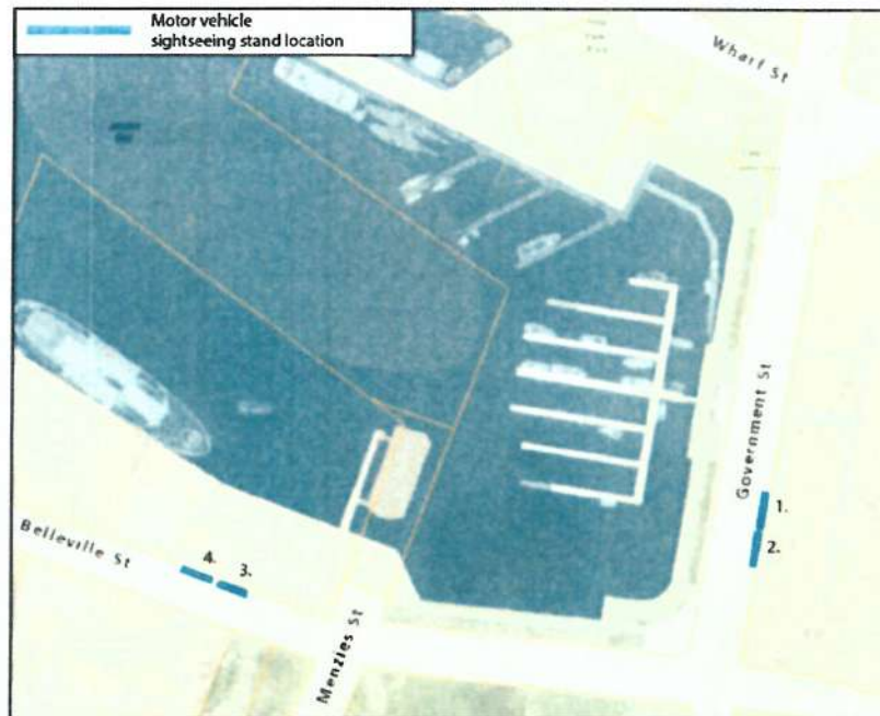
Figure 1 - Parking Stand Locations (1,2,3 and 4).