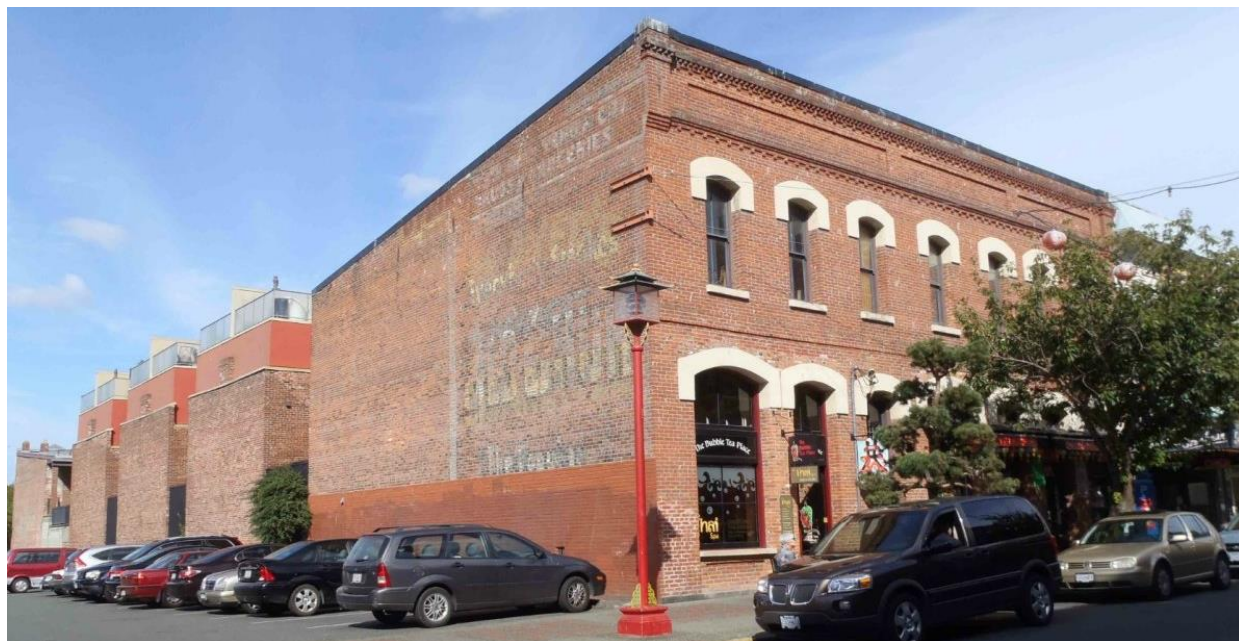
Dragon Alley and Hart Block received TIP for 10 years tax exemption, and BIP funding. There was nothing in the interior that could be saved, facades were restored.

While the TIP has historically supported projects that focused on retaining whole existing buildings with little or no added space, in recent years there have been examples where a tax incentive has been granted even though only a portion of a heritage building was retained. Some of these, including Dragon Alley, have been highly successful in revitalizing and highlighting important heritage sites within the city. This, perhaps in combination with much of “the low hanging fruit has already been picked,” along with increasing construction costs and stricter seismic code upgrades, has led to more applicants requesting that their partial retention projects receive a tax incentive.