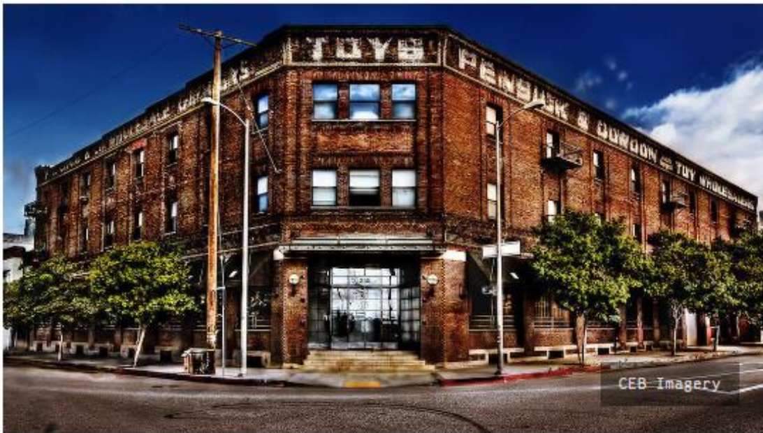
Former toy warehouse in Los Angeles, adapted/ converted into loft apartments.

There may be a benefit to expanding eligibility to include projects that are multi-use or result in an entirely residential project with no commercial component. The report recommendation includes direction that would allow for the exploration of opportunities for expanding the number and types of projects that are eligible for some form of municipal support, to continue to expand heritage retention and ensure that key heritage resources are protected and seismically upgraded.