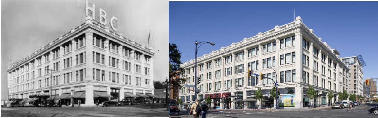
The Hudson Bay Co. department store converted into condos with commercial at ground level. An example of rehabilitation, adapted for a contemporary new use. Received a TIP in 2010 for 10-year tax exemption as well as BIP funding for the restoration of the facades.