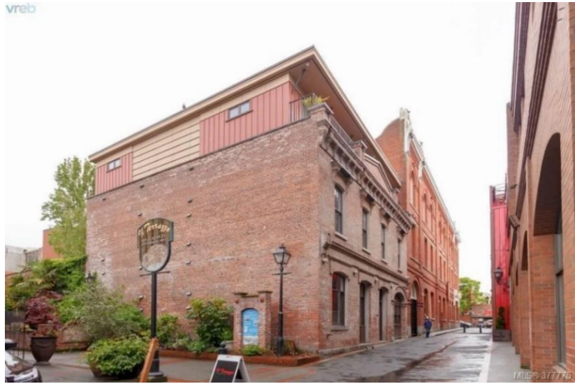
Before and After - Morley Soda Factory, TIP received with one storey addition, an example of rehabilitation and an adaptive reuse of an industrial building, converting into live/work and residential units.

Despite the debate, it is noted that all these approaches advance forms of adaptive reuse which can achieve positive outcomes, and arguments can be made for the retention of only part of a building or the façade. As the “face” of the building, in many cases it is the only part that is experienced by the public and it helps retain the original character of streetscapes and neighbourhoods while preserving urban landscape histories. From a development perspective, it may also be more achievable in terms of changing building code requirements and economic realities.