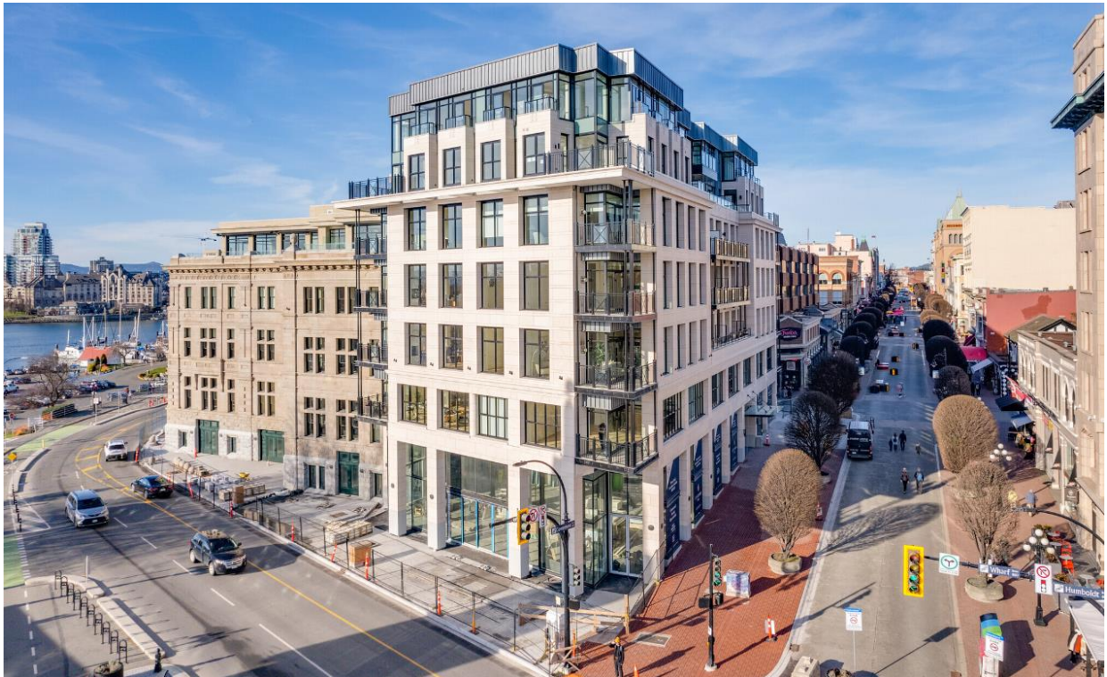
Customs House during construction (above) and redevelopment completed (below). Received a 10-year tax exemption, on partially retained heritage building. An example of facadism, adaptive-reuse, and rehabilitation.