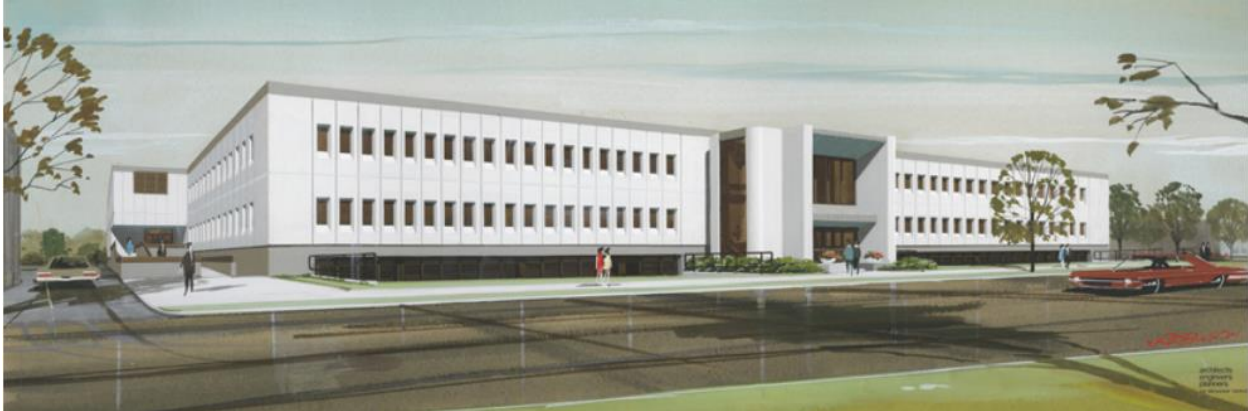
Victoria Press Building, Non-Residential Use, seismic upgrade and adaptive re-use project. TIP application has initial approval and going through final steps of the process.

There may be a benefit to expanding eligibility to include projects that are multi-use or result in an entirely residential project with no commercial component. The report recommendation includes direction that would allow for the exploration of opportunities for expanding the number and types of projects that are eligible for some form of municipal support, to continue to expand heritage retention and ensure that key heritage resources are protected and seismically upgraded.