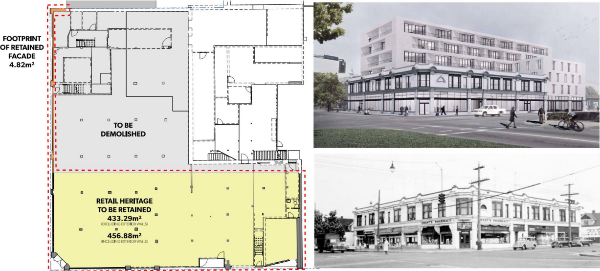
Wellburns at 1050 Pandora, currently under construction. The historic building was partially retained. Approximately 50% of the building was removed to accommodate a 4-storey rooftop addition, a side-by-side addition and underground parking. The project will preserve portions of the façade, restore the storefronts, and rehabilitate the building for continued use, of commercial on the ground level, with residential above. This TIP Application is still under consideration by Council.