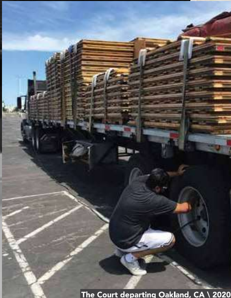
The Court departing Oakland, CA \ 2020