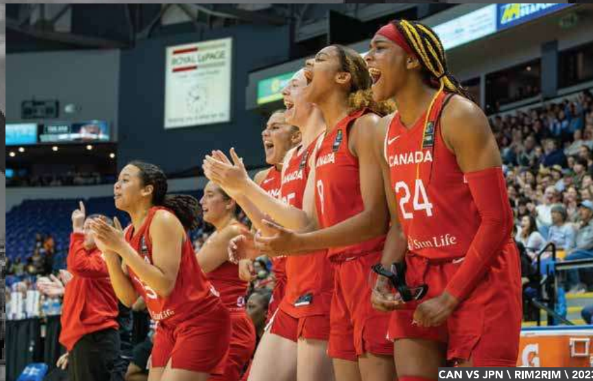
CAN VS JPN \ RIM2RIM \ 2023

This summer, both of Canada's senior national basketball teams will compete at the Paris 2024 Summer Olympics in what is being hailed as a once-in-a-generation moment. Our women's team, currently ranked 5th in the world, is poised to medal for the first time, while our men's team aims to bring home their first medal since 1936.