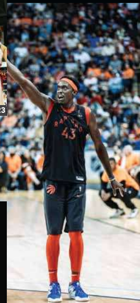
Raptors Training Camp & Scrimmage \ 2022

FIBA OLYMPIC QUALIFYING TOURNAMENT 2021 VICTORIA, CANADA