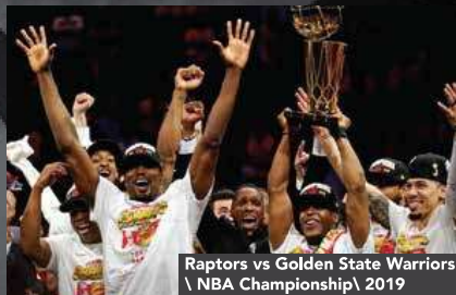
Raptors vs Golden State Warriors \ NBA Championship \ 2019