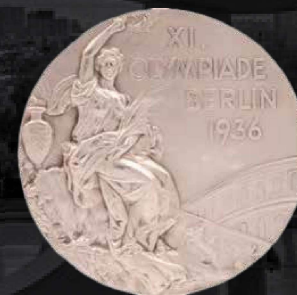
TEAM CANADA \ Silver Medal \ Berlin Olympics \ 1936

This June, Friends of Victoria Basketball, in collaboration with Rifflandia Entertainment Company, are looking to build upon Victoria's legacy as a premier host city for all things basketball by welcoming the senior women's national team to BC's capital for their official 2024 Olympic training camps.