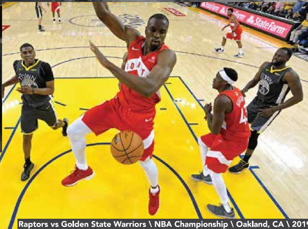
Raptors vs Golden State Warriors \ NBA Championship \ Oakland, CA \ 2019