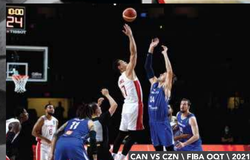
CAN VS CZN \ FIBA OQT \ 2021