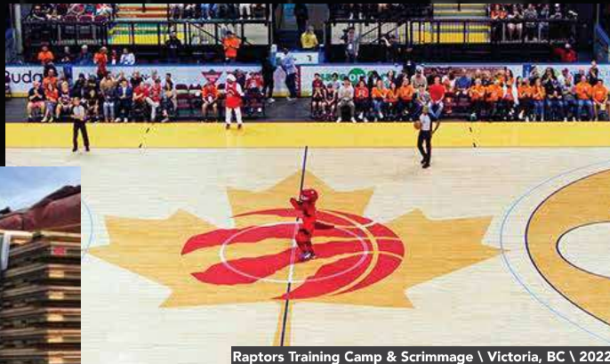
Raptors Training Camp & Scrimmage \ Victoria, BC \ 2022

In early 2020, Friends of Victoria Basketball successfully acquired the complete and original basketball court used in Game 6 of the 2019 NBA Championship Series from The Oracle Arena in Oakland, CA. It is currently housed in Victoria, BC and has been used to host high-profile games over the past three years, having been dubbed "Canada's Court" in recognition of the Toronto Raptors' historic win that united our nation.