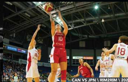
CAN VS JPN \ RIM2RIM \ 2023