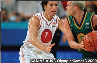
CAN VS AUS \ Olympic Games \ 2000