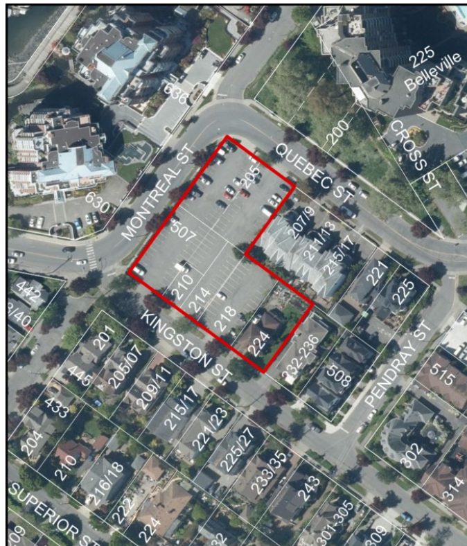
Figure 1. Aerial photo of subject site