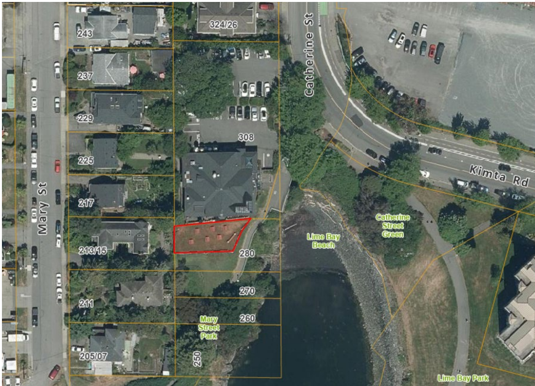
Figure 1 - Previous Patio Area