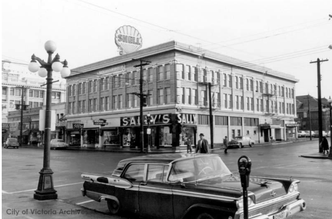
Figure 1 1601-1605 Douglas Street, Fairfield Block. Date, 1961. C