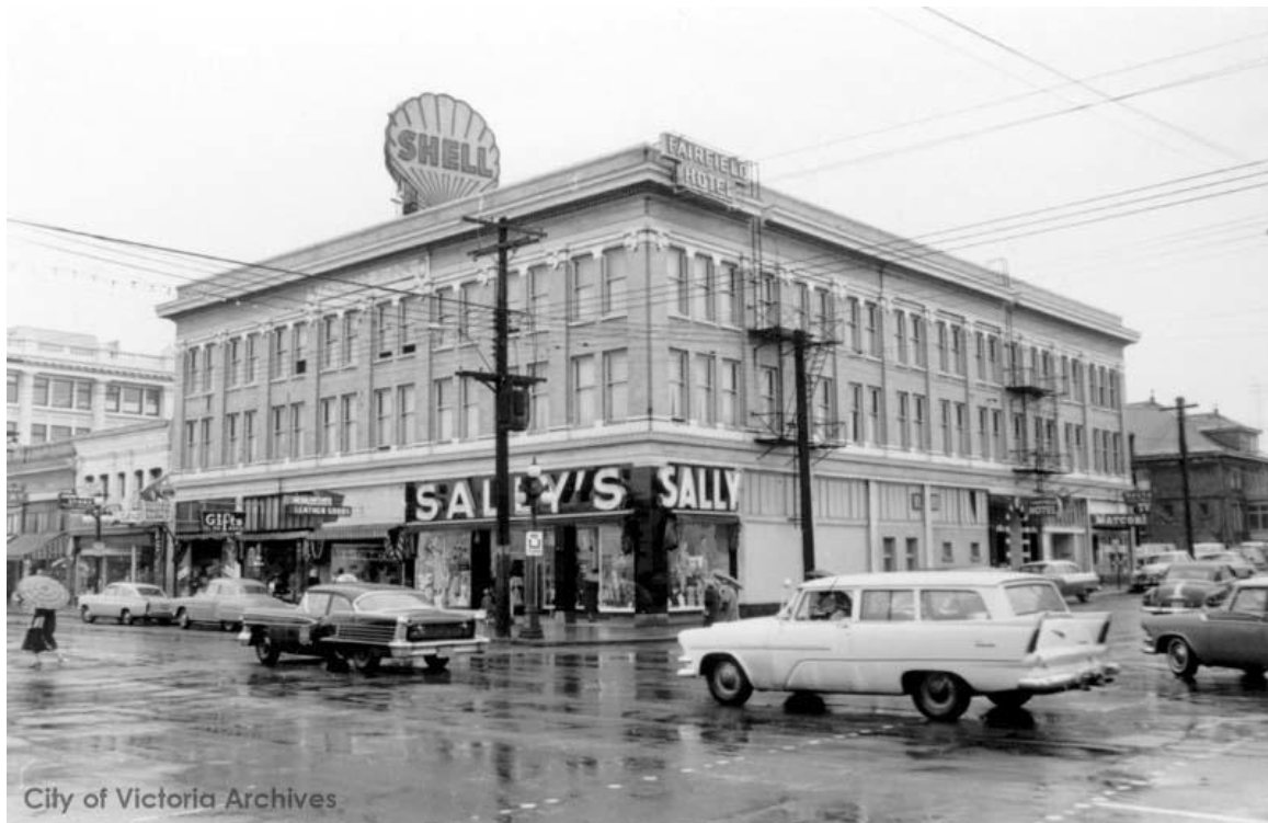
1601-1605 Douglas Street, Fairfield Block. Date between 1959-1974.