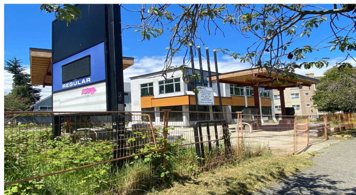
This gas station remains derelict in James Bay.

A James Bay resident has started an online petition to try to fuel the city council to do something about a gas station project at 308 Menzies that appears to be running on fumes.