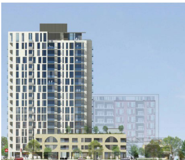
Figure 4. Previous Proposal: West Elevation