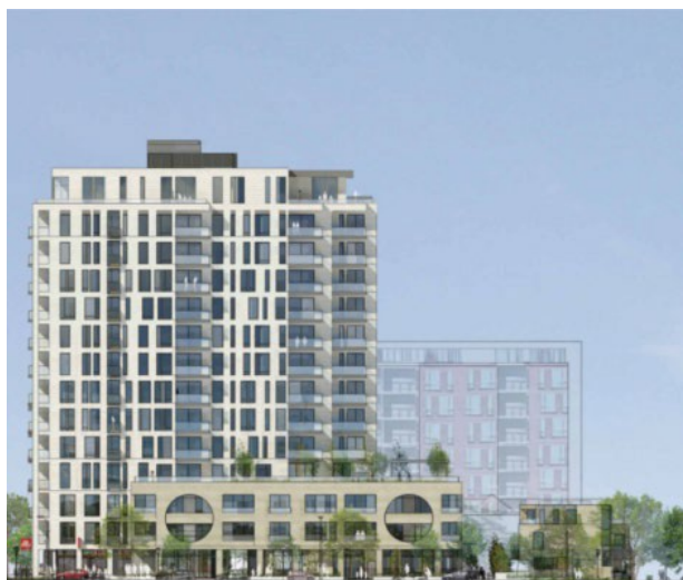
Figure 3. Current Proposal: West Elevation