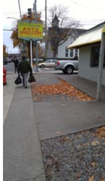
Cook Street – view north