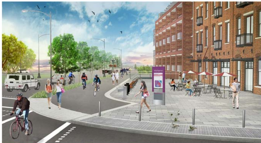
NORTH EAST PLAZA