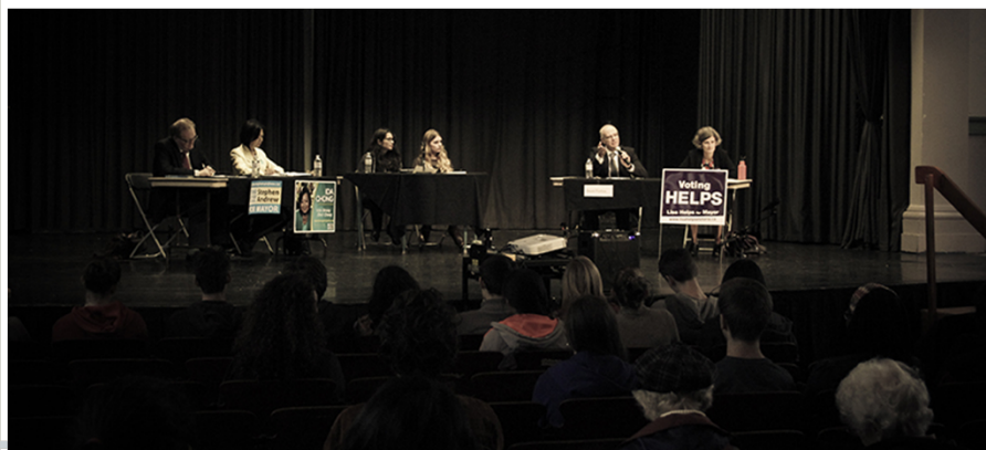
Youth Q&A with Victoria's Mayoral Candidates

BC Healthy Communities People. Place. Potential.