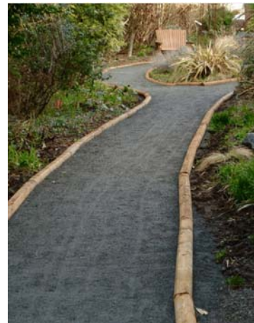
North Jubilee Spirit Garden