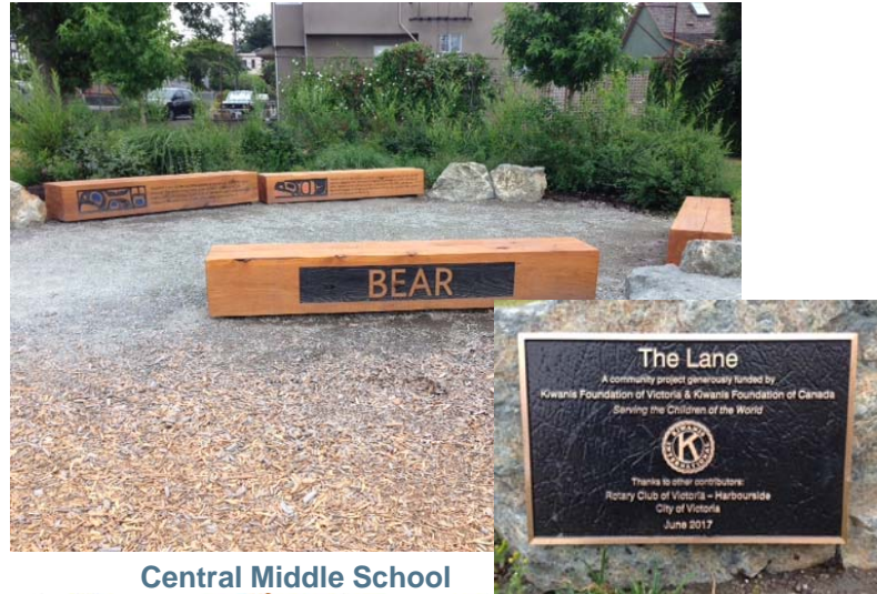
Central Middle School