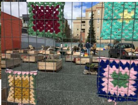
Yates St. Community Garden