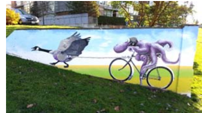
Burnside Gorge mural project