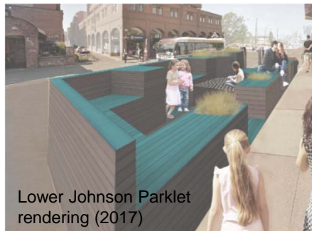
Lower Johnson Parklet rendering (2017)