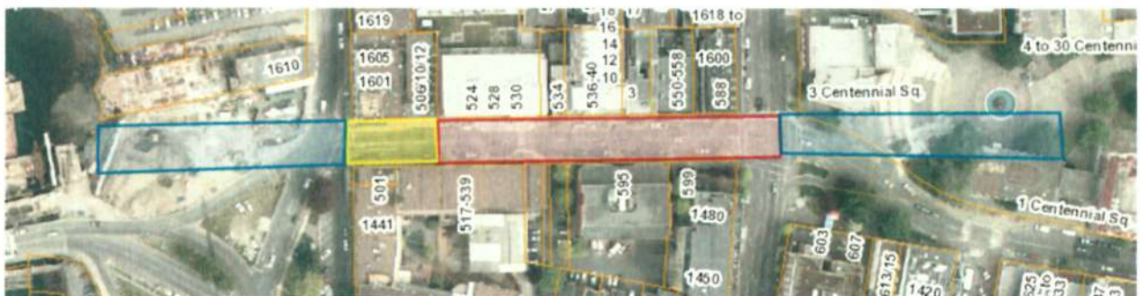
Figure 1 - Fibre Optic Route from Johnson Street Bridge to City Hall

To facilitate the connection without extensive construction of pipe conduits and to seek cost savings, staff have approached Shaw and developed a plan to connect City Hall to the new Johnson Street Bridge by maximizing use of existing infrastructure in the 500 block of Pandora Avenue. The City owns fibre optic conduits within the area in blue shading, as shown on Figure 1. Shaw owns the fibre optic conduits within the area in red shading, as shown on Figure 1.