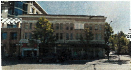
STREET VIEW 1601 Douglas street