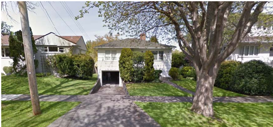
Property to Northwest 1450 Clifford St.