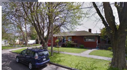
1457 Clifford St.