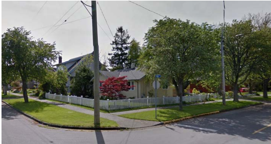
Property to East 358 Arnold Ave.