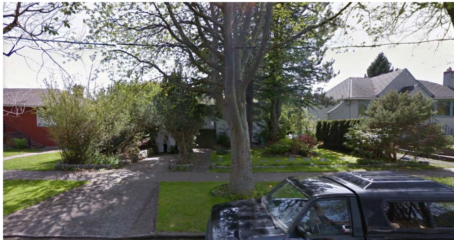
Property to West 1449 Clifford St.