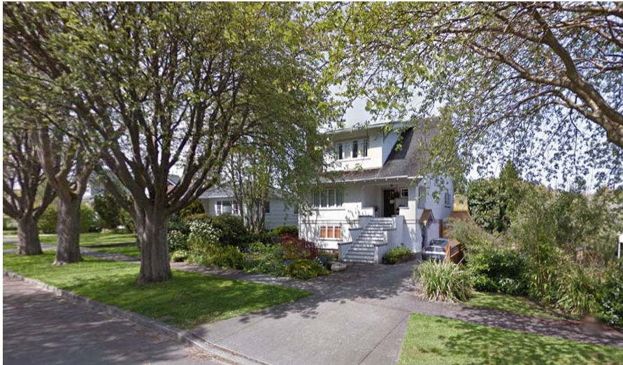
Property to North 1456 Clifford St.