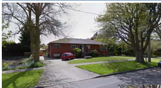
View 1 (from East)