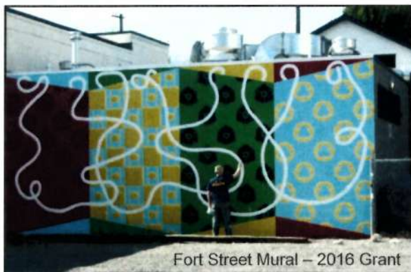
Fort Street Mural – 2016 Grant