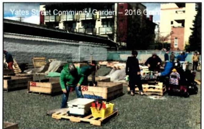
Yates Street Community Garden – 2016 Grant