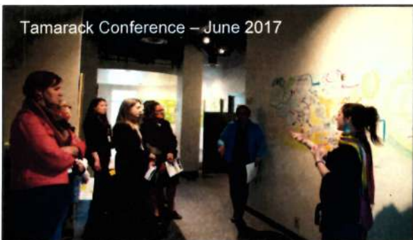
Tamarack Conference – June 2017