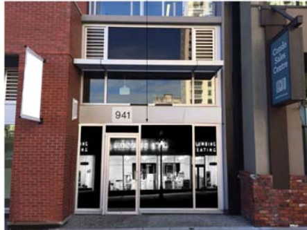
941 FORT STREET - PROPOSED STOREFRONT

PROPOSED ARCHIVAL PHOTOGRAPH WINDOW FILM TREATMENT