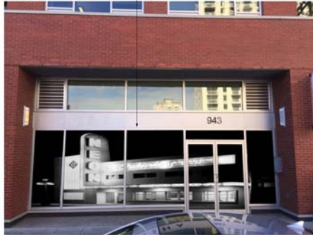
943 FORT STREET - PROPOSED STOREFRONT

PROPOSED ARCHIVAL PHOTOGRAPH WINDOW FILM TREATMENT