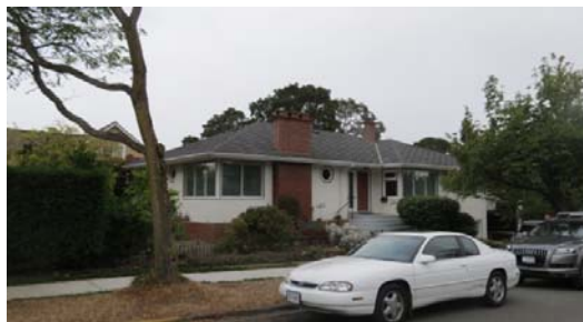
Location of Proposed New Lot