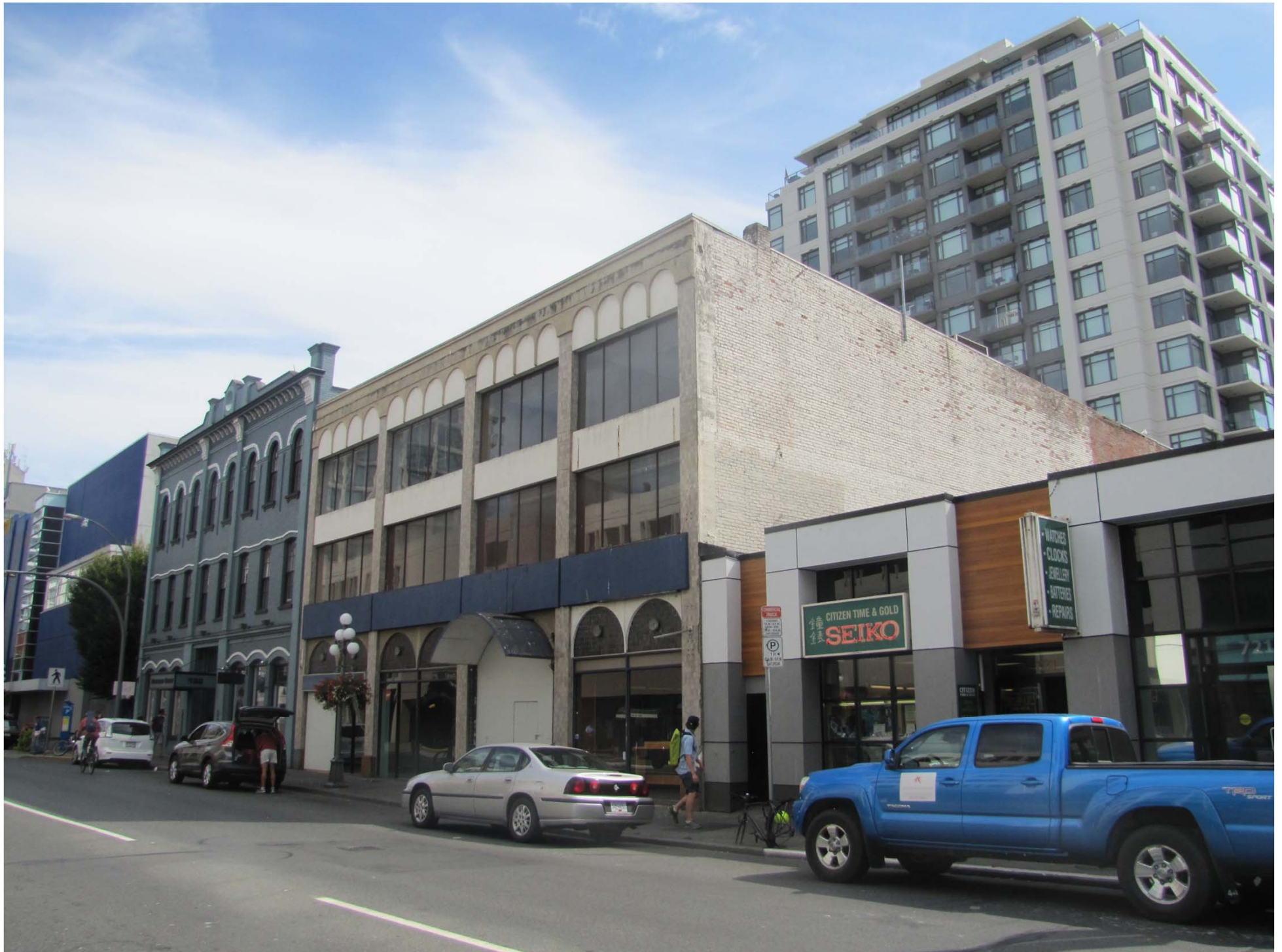
727-729 JOHNSON STREET