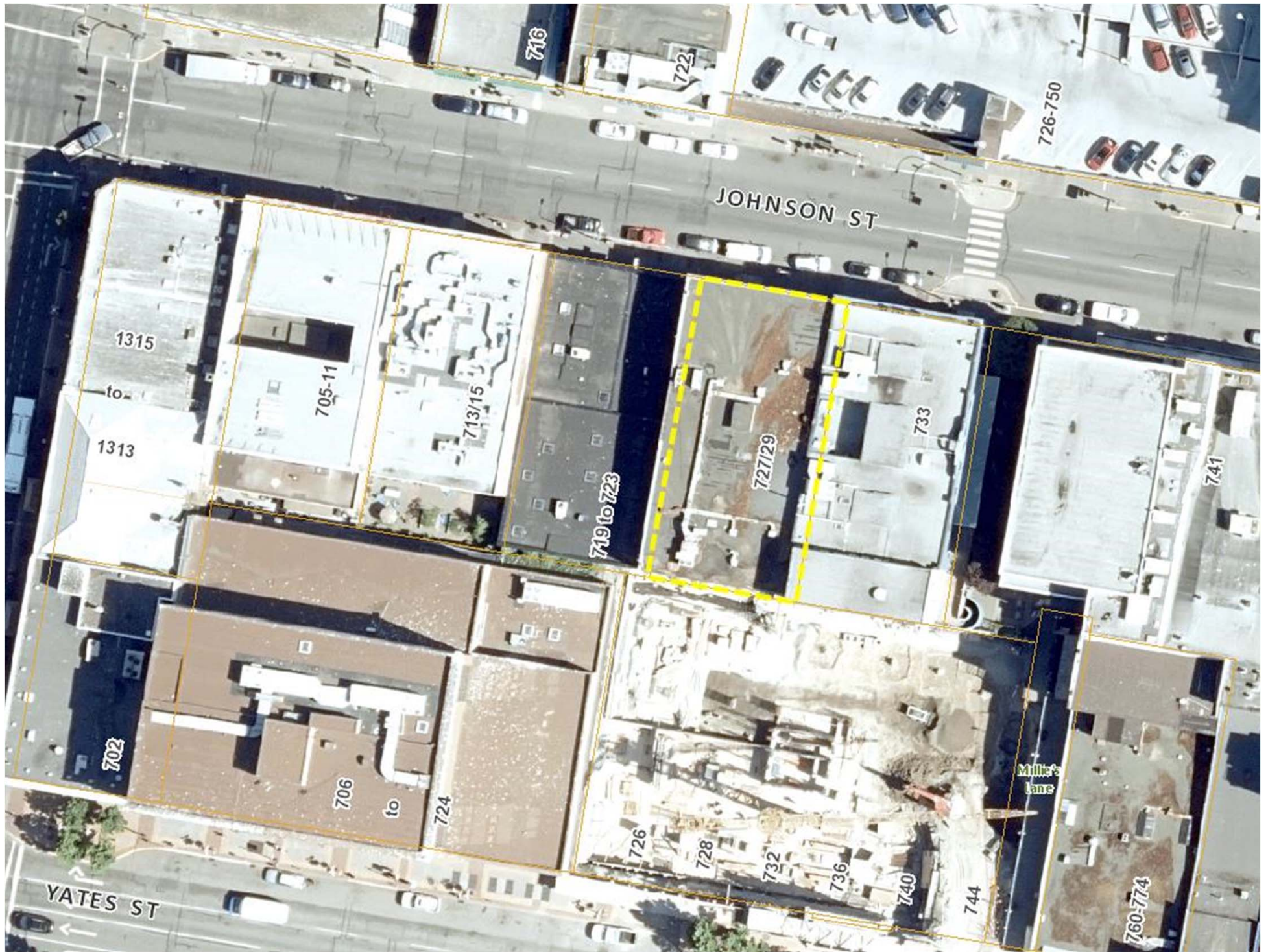
727-729 JOHNSON STREET