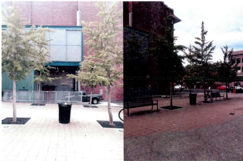
CRD Square at Government Street and Fisgard Street.

Locations around Chinatown were assessed by staff and one location was identified for Council consideration based on the criterion. The installation will not interfere with underground utilities, however, pruning of the trees will be necessary around the statue. The following location is supported by the Foundation and organizing committee.