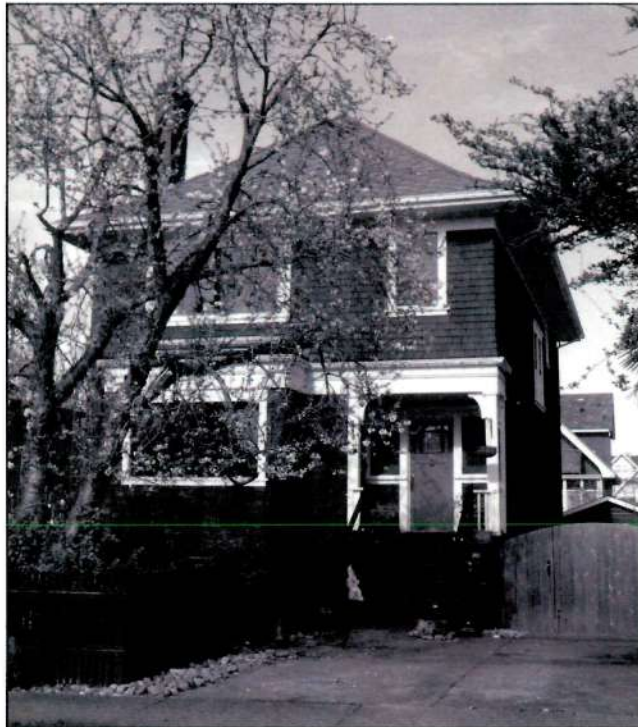
624 Battery Street, 2015