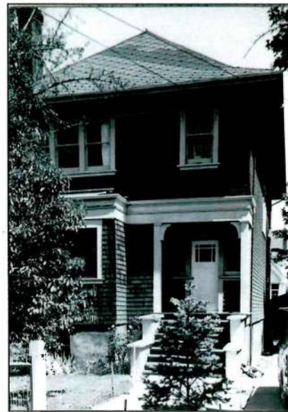
624 Battery St, 1970s