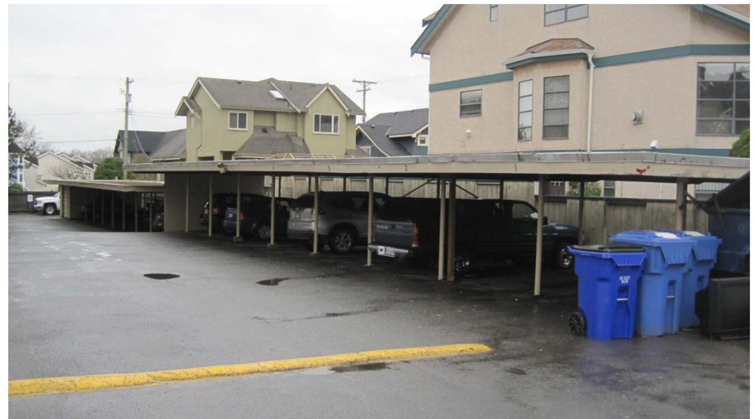
Existing Parking at 450 Dallas Road