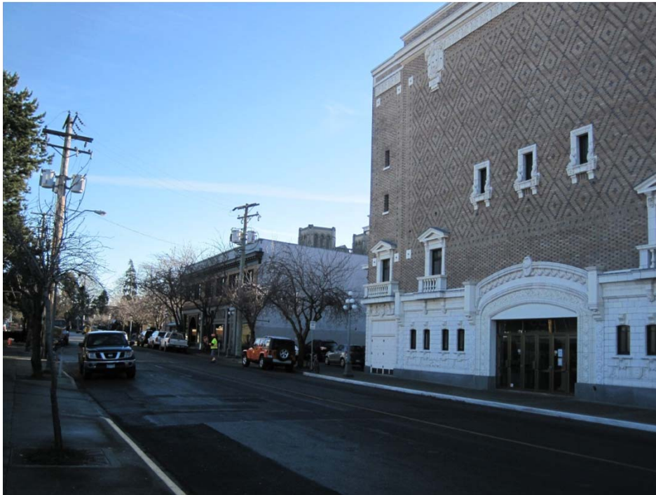
SOUTH (ACROSS BROUGHTON)