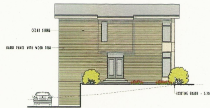
NORTH-EAST ELEVATION Scale - 1/8" = 1'-0"

Roofline slope attempts to address concerns over loss of light