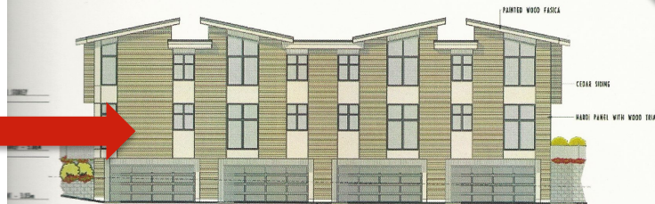
SOUTH-EAST ELEVATION Scale - 1/8" = 1'-0"

No outdoor living space facing 118 Michigan residents