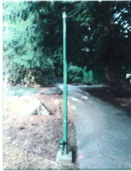
Vic West Park Improvements