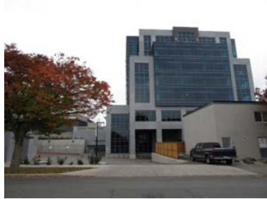
Neighbour to East – from Market Street