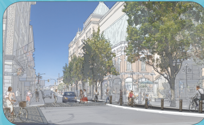
CROSS SECTION AT WEST END OF 800 BLOCK