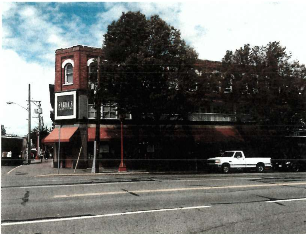
Herald and Government Street Corner