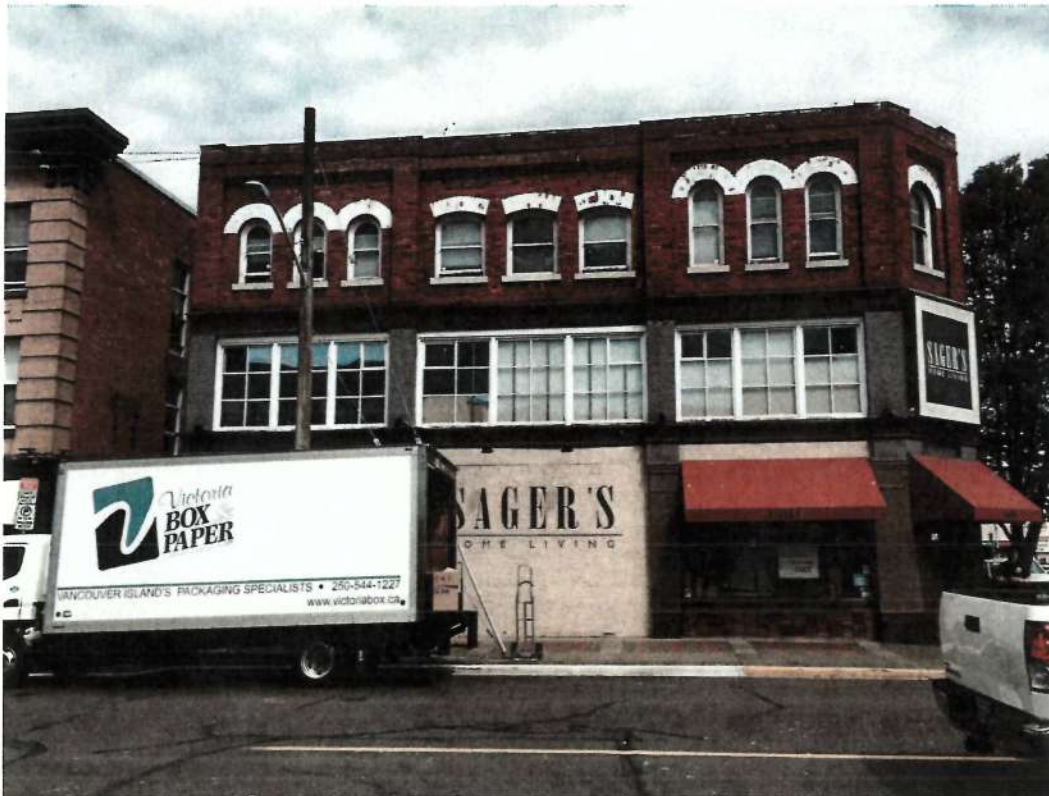
Herald Street Elevation