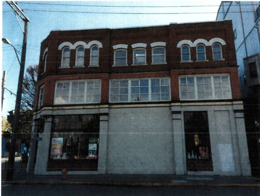
Chatham Street Elevation