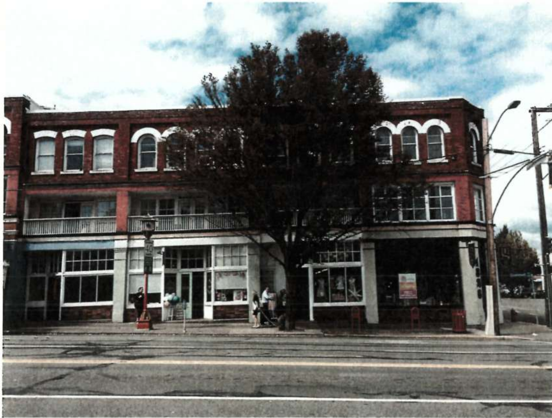
Government Street at the corner of Chatham Street