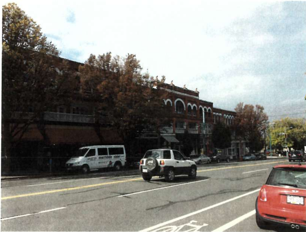
View down Government Street from Herald