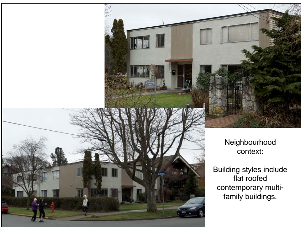
Neighbourhood context: Building styles include flat roofed contemporary multi- family buildings.