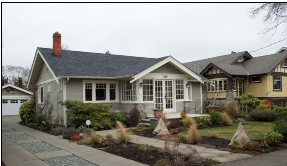
Neighbourhood context: Building styles range from cottage in scale through to grand in scale.