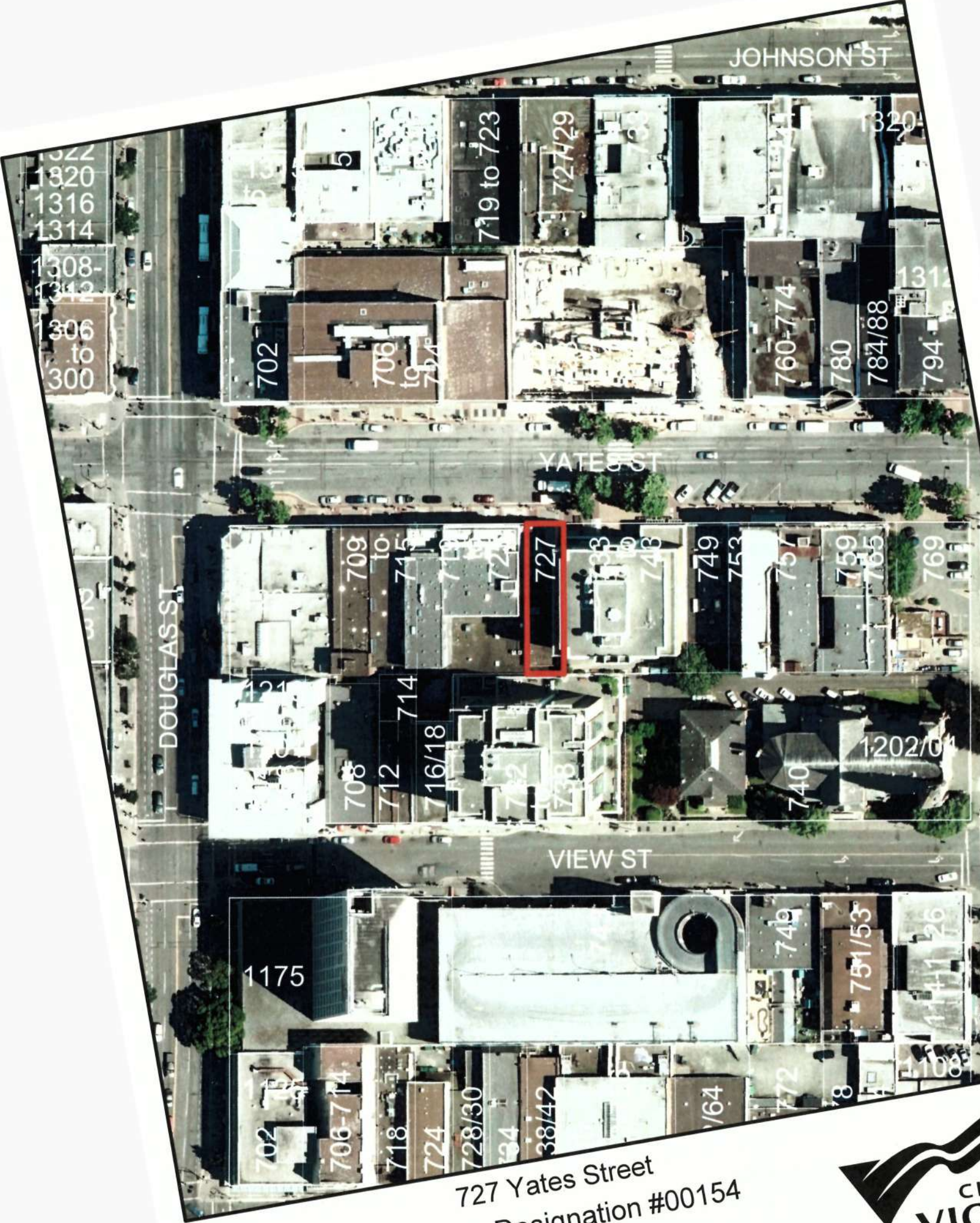
727 Yates Street Heritage Designation #00154