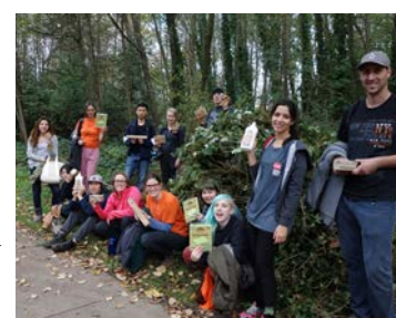
Volunteers receiving If You Care Environmentally Friendlier products (recycled foil, compostable parchment paper, natural sponge cloths)