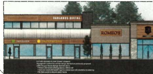
2 Hillside Avenue - Elevation Detail Scale 1:100