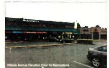
Hillside Avenue Elevation After Renovations