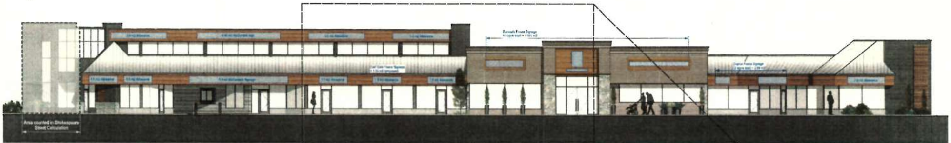
1 Reference Elevation - Hillside Avenue Scale 1:300