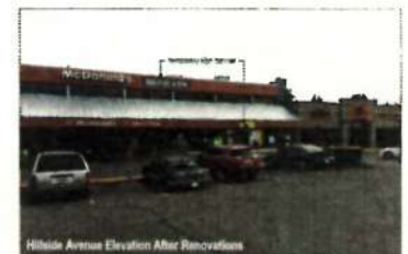
Hillside Avenue Elevation After Renovations