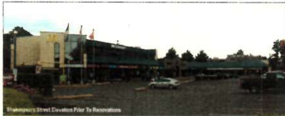
Hillside Avenue Elevation Prior To Renovations