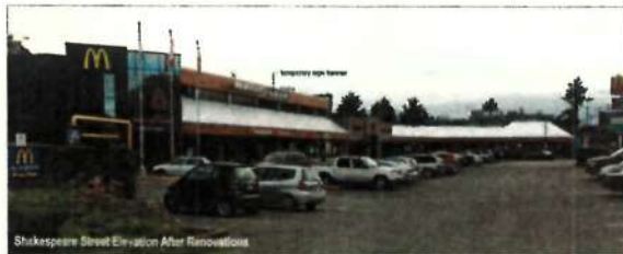
Hillside Avenue Elevation After Renovations