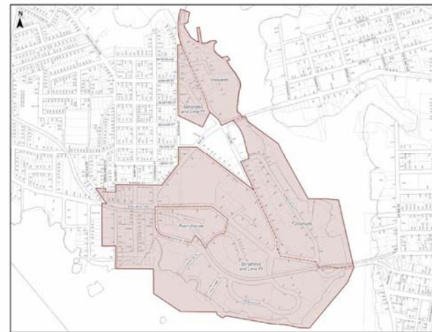
Map 64: DPA 13: Core Songhees

232 Official Community Plan | CITY OF VICTORIA