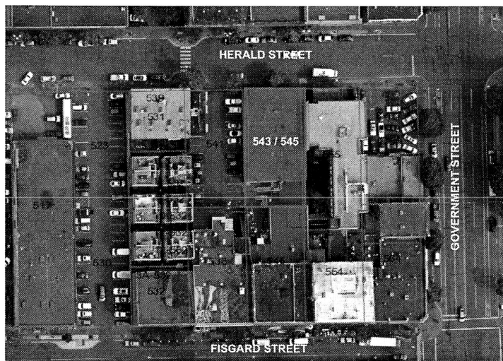
SITE PLAN SCALE: N/A