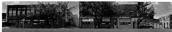
STREET CONTEXT SCALE: N/A