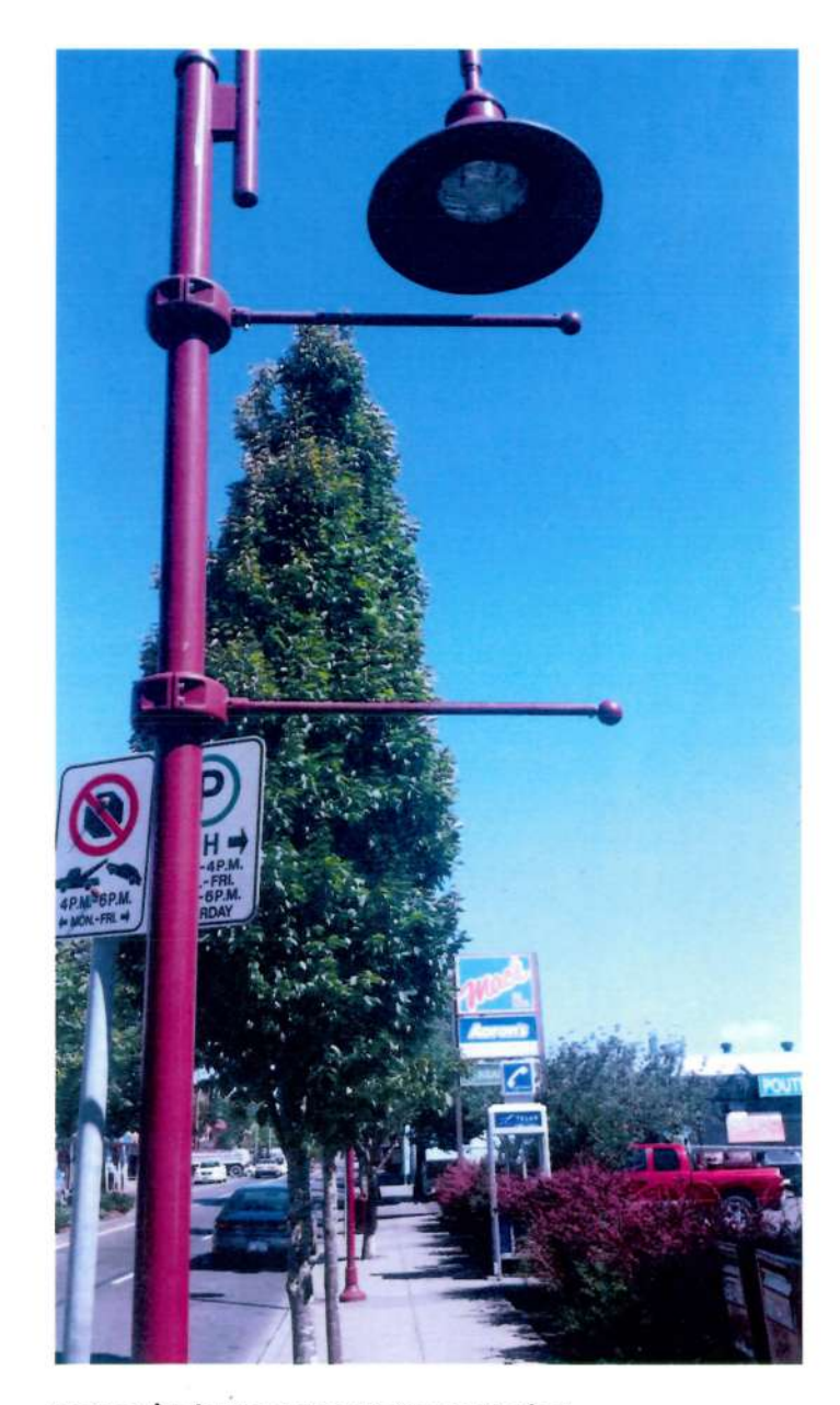
Banner/Light Post Near Fairway Market