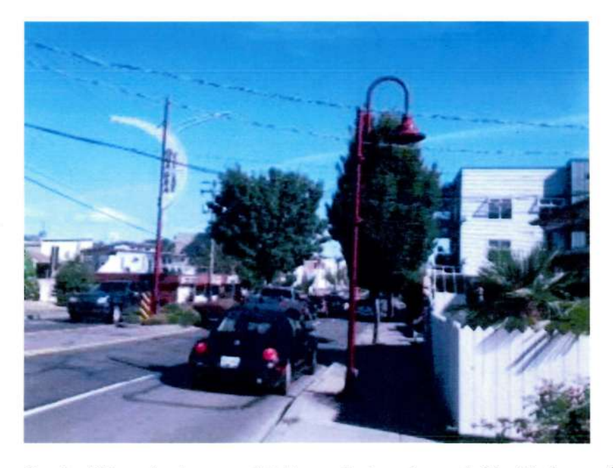
Quadra Village (main season) Gateway Feature (upper left) with banner/ light post near Bay and Quadra