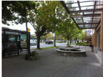
FORT STREET FRONTAGE LOOKING OUT TO STREET