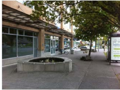
FORT STREET FRONTAGE LOOKING EAST