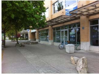
FORT STREET FRONTAGE LOOKING WEST