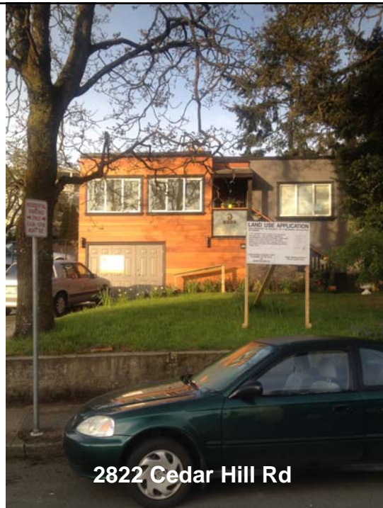
2822 Cedar Hill Rd